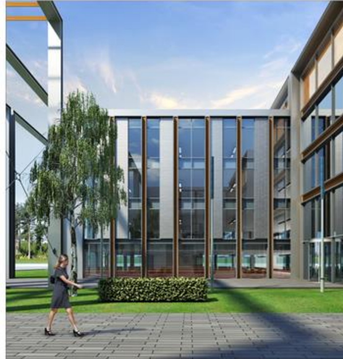
CGI 04 - Side view of Building A from the piazza

NOTE: INDICATIVE CGI-FOR INFORMATION ONLY.