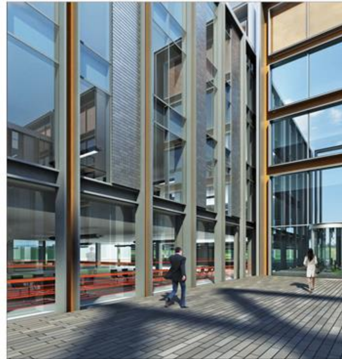
CGI 06 - Main entrance detail

NOTE: INDICATIVE CGI-FOR INFORMATION ONLY.