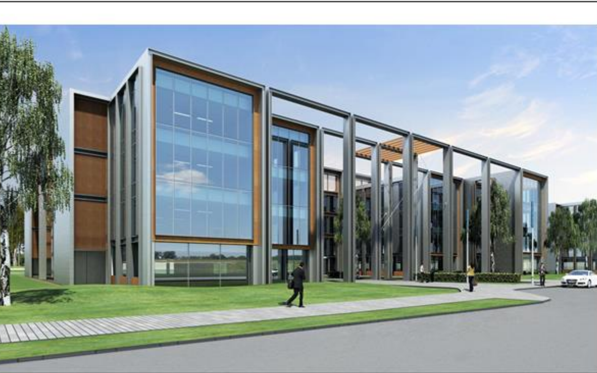
3 - Frontage to Pinehurst Road