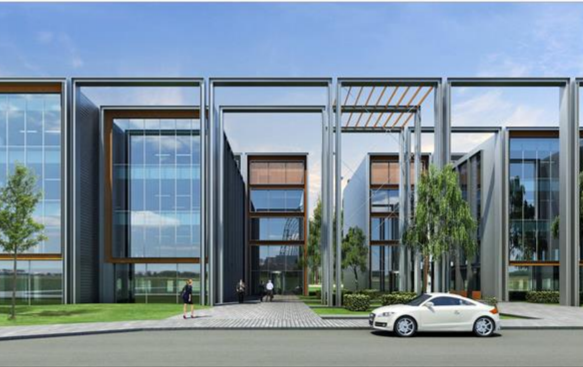
CGI 05 - Main Entrance to A and B-Axial Approach